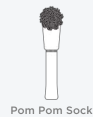
Pom Pom Sock